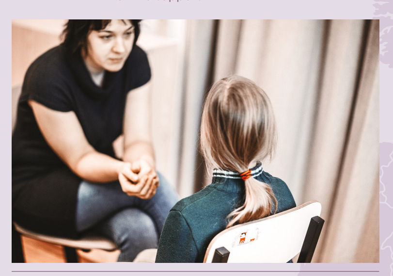
Preventing and ending bullying at school

This programme is not a one-year project, but is designed to be implemented on a permanent basis to ensure that schools remain bullying-free on the long term.