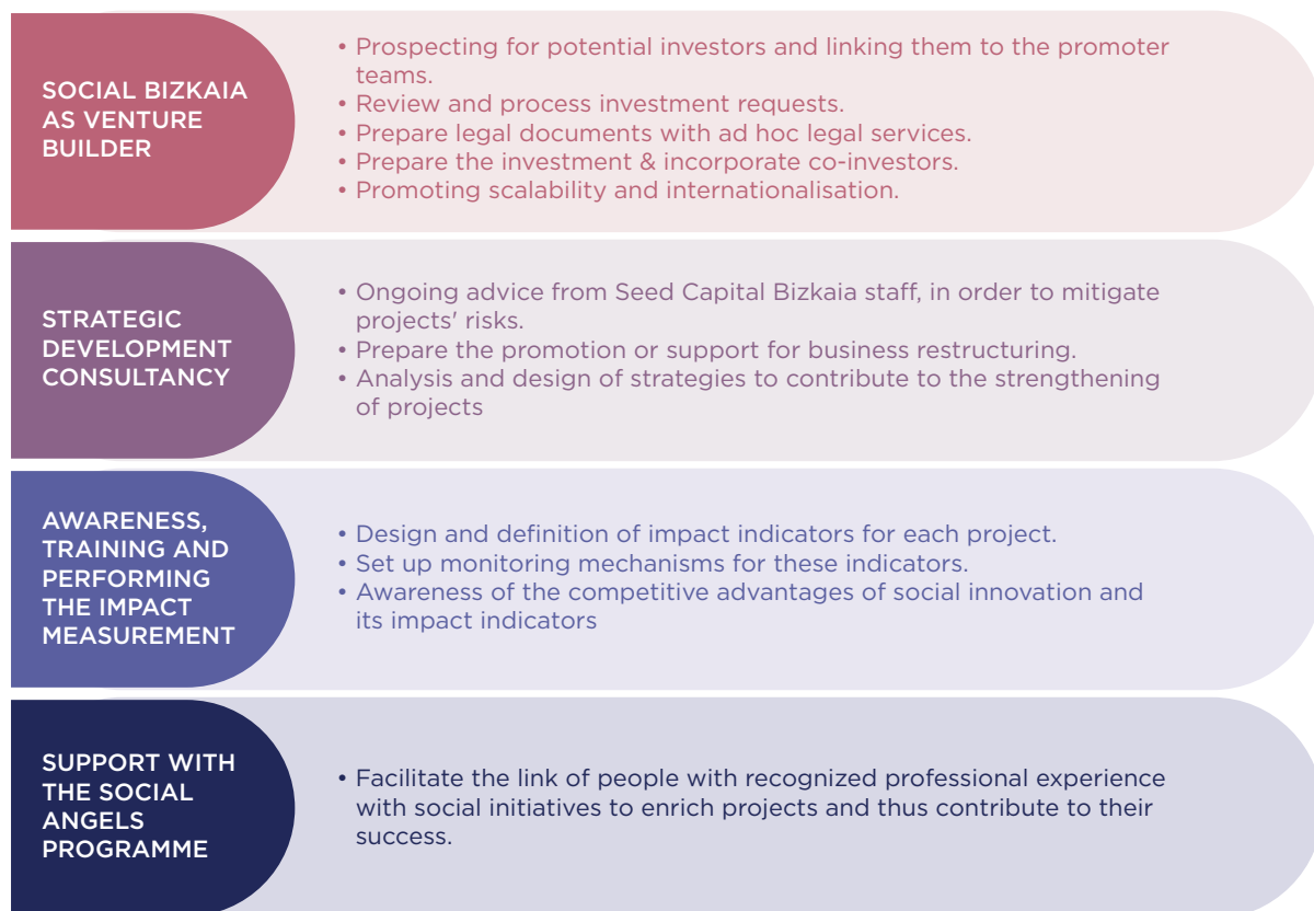
Figure 1. Non-financial support offered through FEIS 3

of the investee companies, as independent directors. They intend to increase the chances of success of the socially innovative projects.